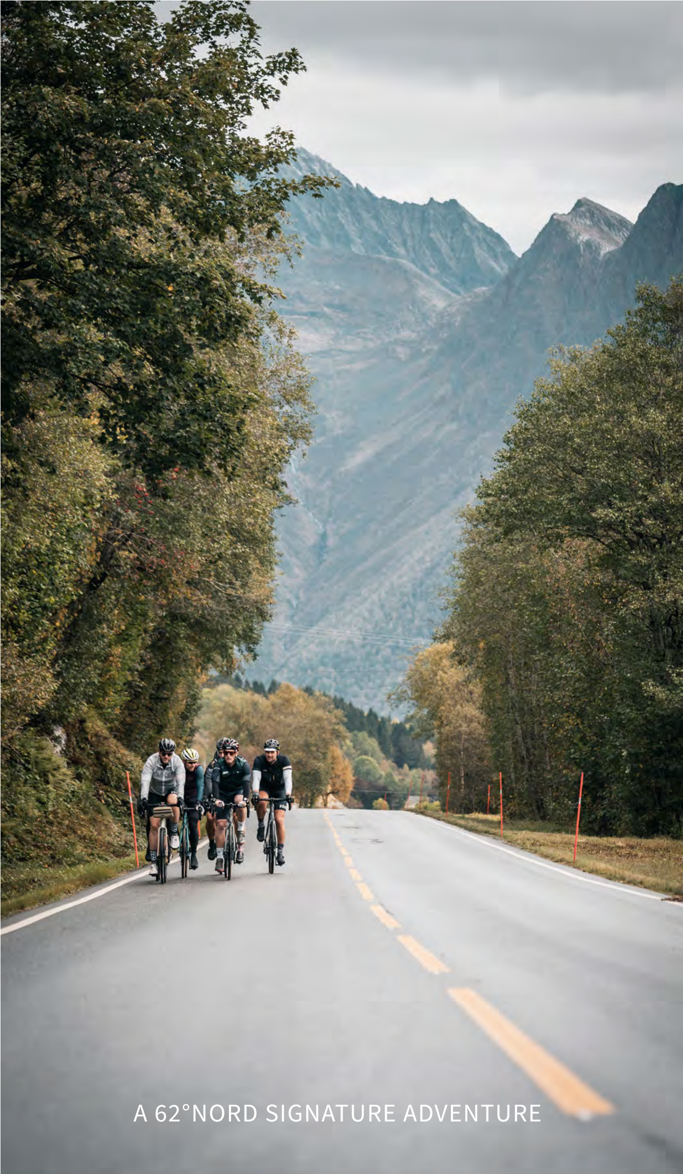
A 62°NORD SIGNATURE ADVENTURE